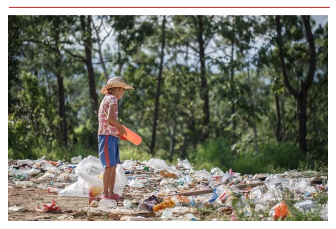
A child surrounded by garbage.