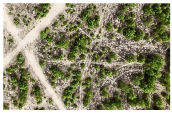
Vehicle Lanes.

Rail lines were the souls of the empire and its colonial economy. As rails aided progress in industrial countries, they brought political, social-economic, and environmental entanglements to the colonies. The rail lubricated "contaminated diversity", whereby humans and the more-thanhumans travelled from one area to the other to create "alien" ecologies. It accelerated the exploitation of resources, drained labour (forced and cheap), decimated natural resources (land, forestry and minerals) and shaped ecologies in the colonies and the metropoles as well. The railways speeded up global overheating, and eventually, the rail deteriorated when the colonial project ended. In this paper I ask: What kind of world-making practices can we observe through the ruins of the colonial rail? What agency does/did the rail have in creating and re-creating "ghost" ecologies?